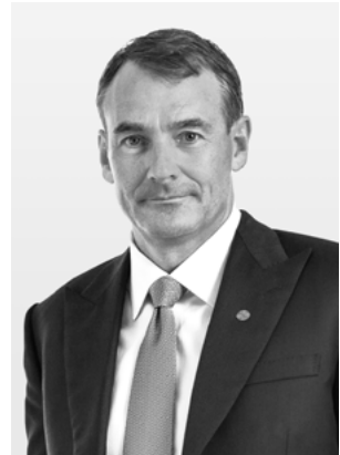
Bernard Looney Chief executive officer